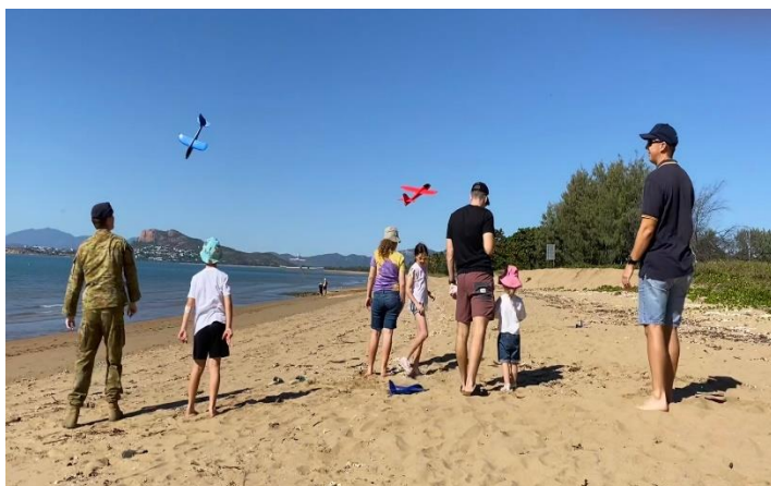
My Dad & Me