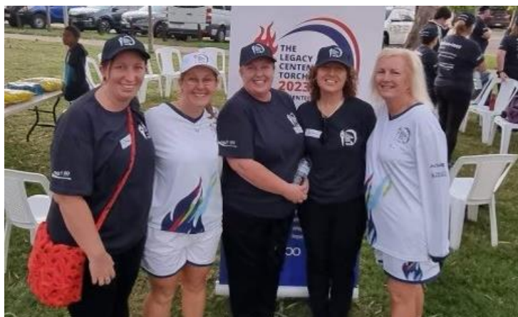
Legacy Torch Relay