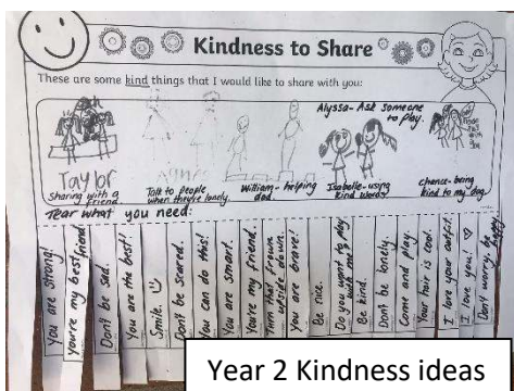
Year 2 Kindness ideas