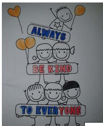
Year 3 Poster